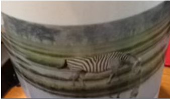
You get to decide how long your photo can be viewed.

Snapchat is a photo-sharing app with a twist. The photos you send disappear seconds after they're viewed – you get to decide how long a photo will "live," from